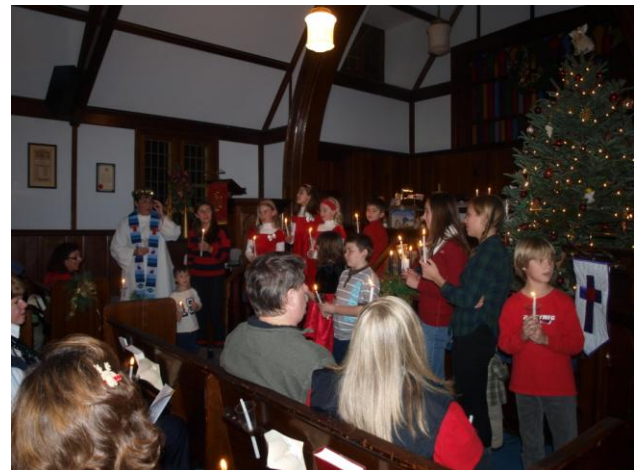
"And to all a good night!"